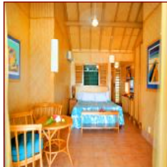
BEACHFRONT SUITE INTERIOR